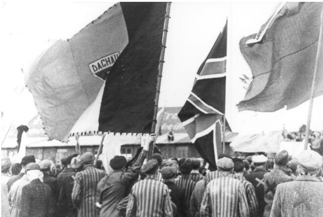
The first celebration of liberation, on May 1, 1945