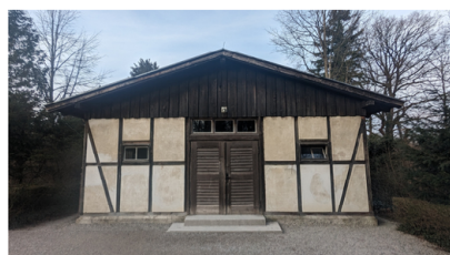
Illustration 50: The first crematorium building, 2024.