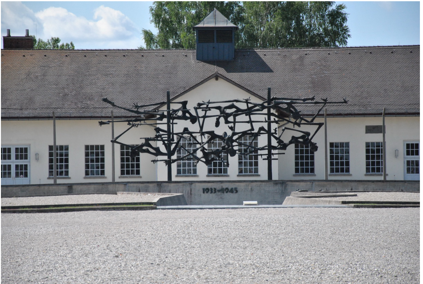
Photograph of the International Monument at the Dachau Concentration Camp Memorial Site, taken in 2012, KZ-Gedenkstätte Dachau.